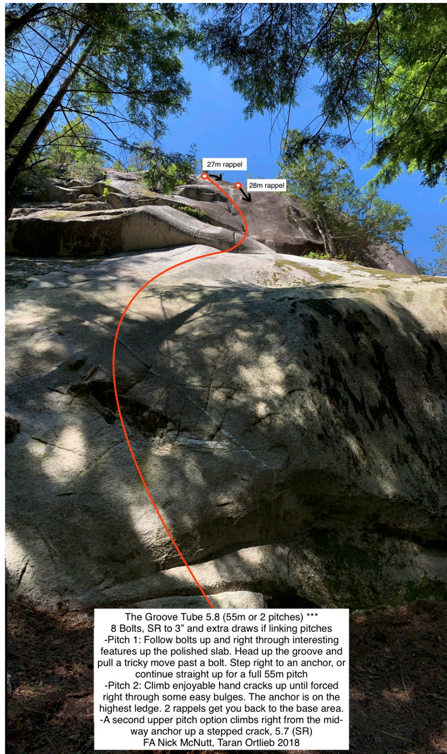
The Groove Tube 5.8 (55m or 2 pitches) *** 8 Bolts, SR to 3° and extra draws if linking pitches -Pitch 1: Follow bolts up and right through interesting features up the polished slab. Head up the groove and pull a tricky move past a bolt. Step right to an anchor, or continue straight up for a full 55m pitch -Pitch 2: Climb enjoyable hand cracks up until forced right through some easy bulges. The anchor is on the highest ledge. 2 rappels get you back to the base area. -A second upper pitch option climbs right from the mid-way anchor up a stepped crack, 5.7 (SR) FA Nick McNutt, Taran Ortlieb 2018