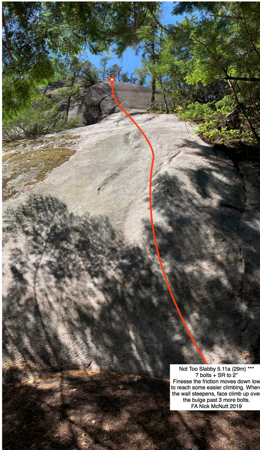
Not Too Slabby 5.11a (29m) *** 7 bolts + SR to 2" Finesse the friction moves down low to reach some easier climbing. Where the wall steepens, face climb up over the bulge past 3 more bolts. FA Nick McNutt 2019