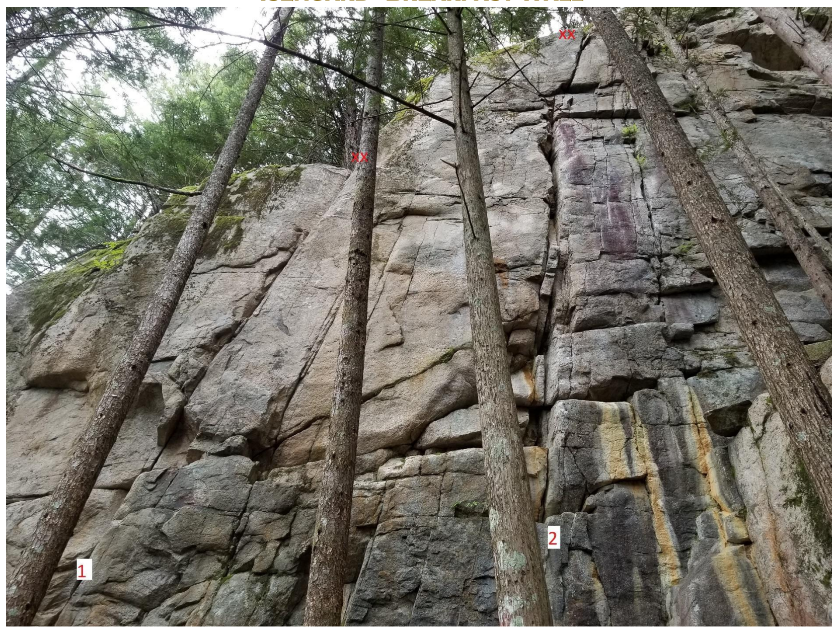
1. Second Breakfast (11b) * 15m Tricky, with a reachy gear placement. Medium offset nuts are the key (2x) .3 to 1, offset nuts