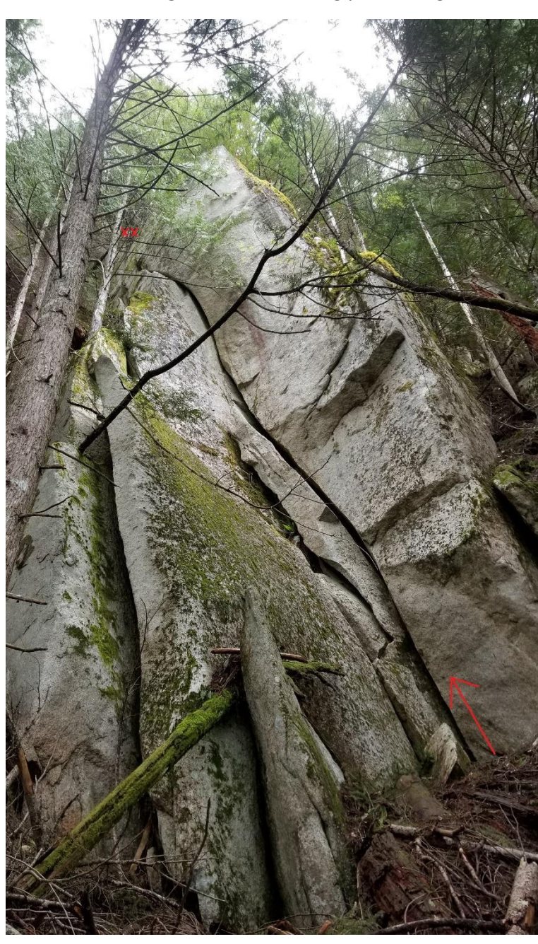
Cracks of Doom (10c) ** 30m A wild adventure up a majestic wide corner. Highly recommended (1 - 2x) .4 to 6

It's a bit of a hike to get to this one. Bring your wide gear and offwidth stoke!